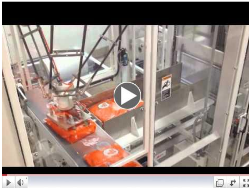
SV199 Double Tight Wrap with Robotics

Take a look at this video where you'll see the Double Tight Wrap with Vision Guided Robotics in action: